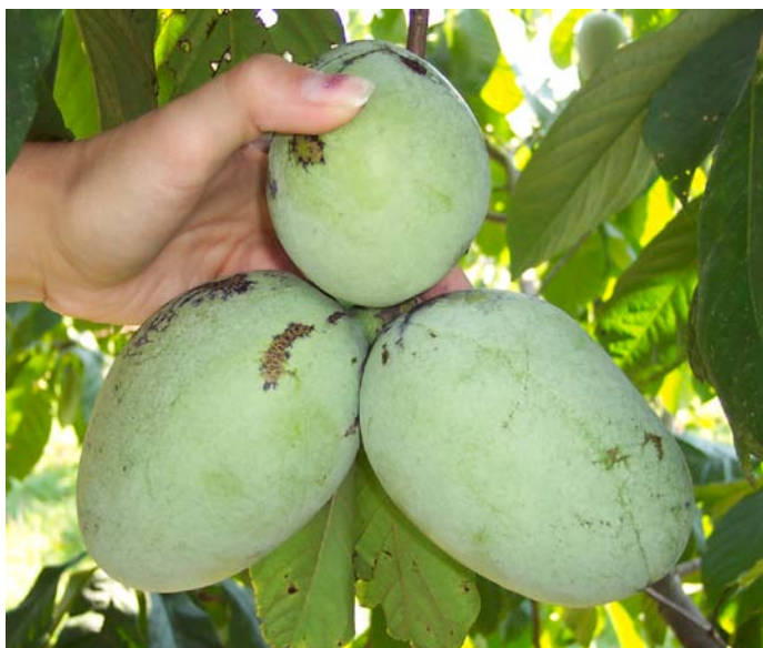
Pawpaw fruit cluster

Newly planted pawpaw trees do not compete well with grass, weeds, or other plants. Place straw or woodchip mulch at 6-8 inches in depth extending out at least 3 feet from the trunk to control weeds and retain moisture. Water and fertilize the trees, especially during the first 2 years of establishment.