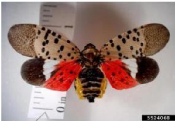
Figure 1: An adult spotted lanternfly has a very distinctive and colorful appearance. The fore wings are half spotted and half reticulated, while the back wings are a mixture of black, white, and red.

What is Spotted Lanternfly? Spotted lanternfly (aka SLF) is a serious invasive insect pest capable of building large populations. SLF is native to East Asia and was first found in southeastern Pennsylvania in 2014. Since that initial discovery, it has spread to many counties in Pennsylvania, as well as into Virginia, New Jersey, Ohio, Delaware, New York, Connecticut, Maryland, and West Virginia. SLF is very distinctive in appearance; the adult is about an inch long with strikingly patterned forewings. The upper portion of these wings have black spots and the tips have a latticework of black rectangles. The back wings are contrasting red, black, and white. The immature stages are black with white spots and develop red patches as they age.