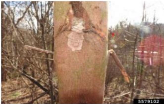
Figure 3: Be on the lookout for the weird looking adults and for the egg masses spackled onto surfaces as seen here. Don't bring home any unwanted hitchhikers and help us by reporting odd sightings!

What does it do? Tree of Heaven (another non-native/invasive species) is the primary host for SLF. However, this pest is also known to feed on over 70 other plant species, including important hosts such as grapes, hops, maple, and black walnut, amongst other hardwoods and fruit crops. SLF is a true bug, part of the order Hemiptera, and they feed using piercing sucking mouthparts. As they feed, they excrete honeydew, a sugary fecal material that accumulates on nearby plants and surfaces and can attract black sooty mold issues. SLF also invades structures in the fall, similar to brown marmorated stink bugs and Asian multicolored lady beetle. Finally, females will lay their eggs on natural and unnatural surfaces alike. While they use trees, the cryptic egg cases have also been found on cars, lawn furniture, firewood, stones, and many other substrates. This causes issues for quarantine and a headache for those that live in infested areas trying to move goods out of the quarantine area.