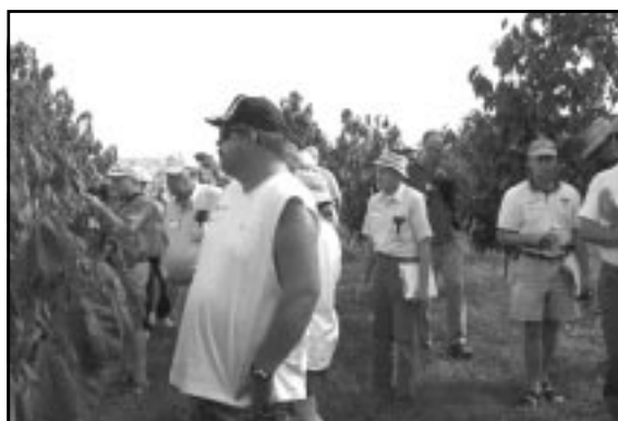
Attendees at the KSU Pawpaw Workshop tour the Regional Variety Trial orchard.